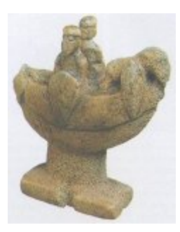
Boat (Rook), ivory, beg XII c, Volkovysk, Belarus, Bielorussian Art Museum, Minsk