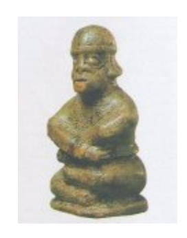
Queen, ivory, XII c, Lukoml, Belarus, State Museum of Belarus