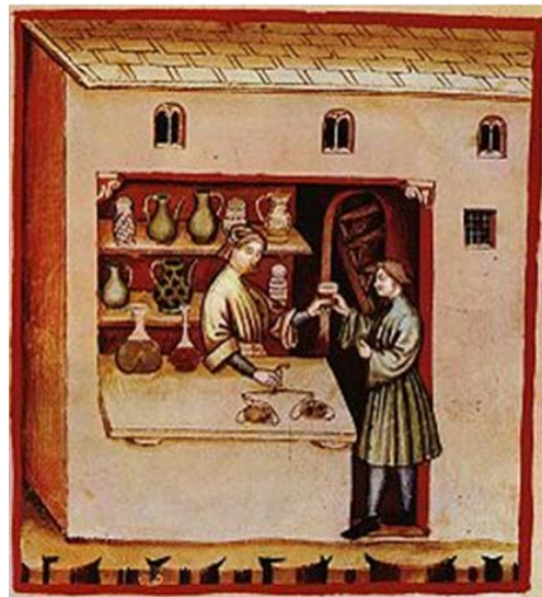
Figure 5 — Pharmacy of the 14th century

Pharmacy of the 14th century is shown in figure 5.