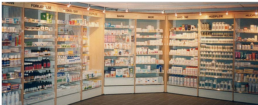
Figure 2 — Modern pharmacy in Norway