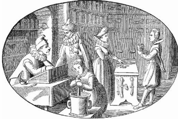
Figure 3 — The Interior of an Apothecary's Shop

The interior of an apothecary's shop is shown in figure 3, the 19th century apothecary in Old Salem (North Carolina, USA) — figure 4.