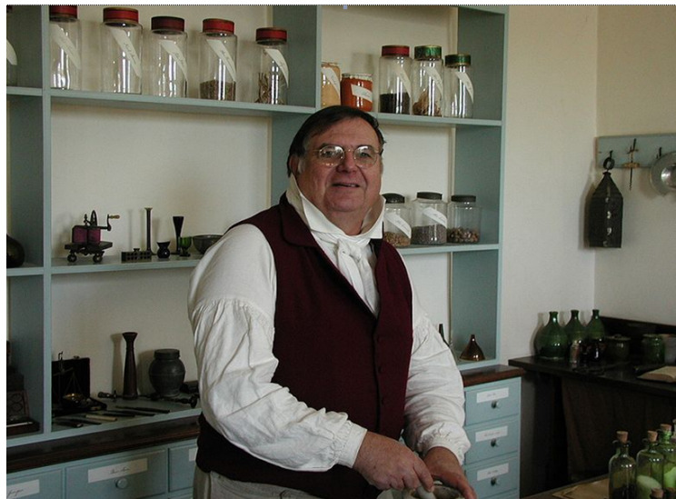
Figure 4 — A 19th century apothecary in Old Salem, North Carolina, USA