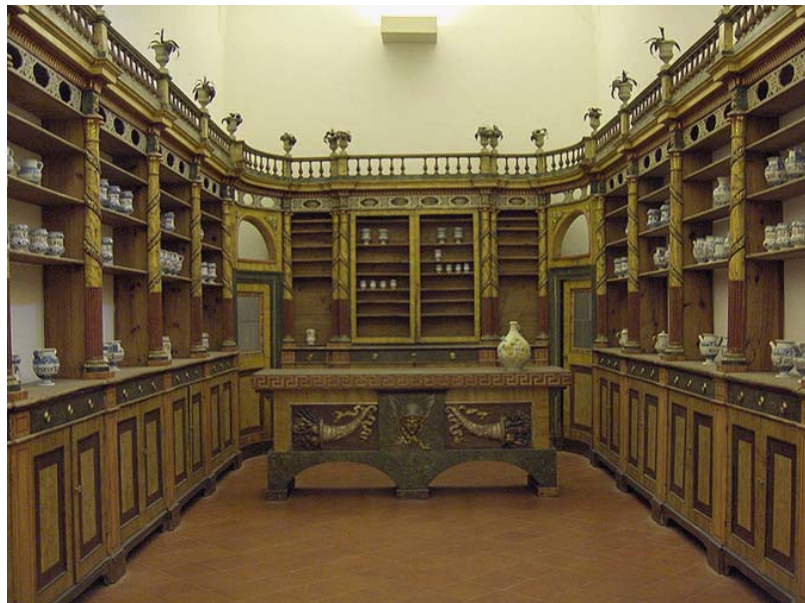
Figure 1 — 19 th century Italian pharmacy

The 19th century Italian pharmacy is shown in figure 1, modern pharmacy in Norway — in figure 2.